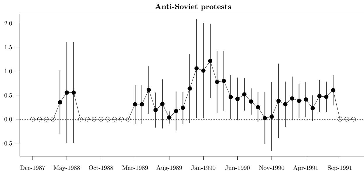
Figure shows IV coefficients with 95% confidence intervals from the model fit on a three month window rolled forward by 30 days. Dependent variables are standard deviation shifts in the incidence of anti-Soviet protests. Hollow circles are for windows with insufficient data.